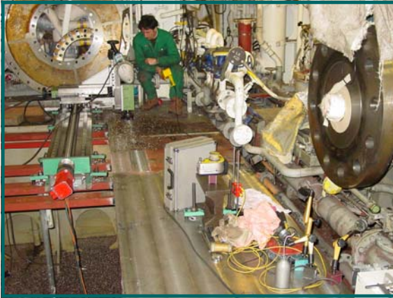
Milling of gear box foundations “MV Superfast V”

24-Hours-Services Worldwide Line-Boring, Milling, Turning, Flangefacing with Laser-Alignment On Site